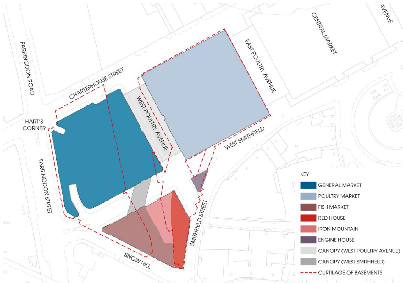
Figure 1 – existing site (above and below ground extents shown)

7 A raised wrought iron canopy structure exists between the General Market and Fish Market and passes over West Smithfield at first floor level. A canopy spans also West Poultry Avenue, a covered north-south route connecting West Smithfield and Charterhouse Street which bisects the two market buildings. The General Market and Fish Market are served by a basement of a substantial size, as is the 1960s Poultry Market. This is shown in Figure 1 in red outline and is split by the Thameslink railway tunnel, the tracks and sidings of which are also at basement level.